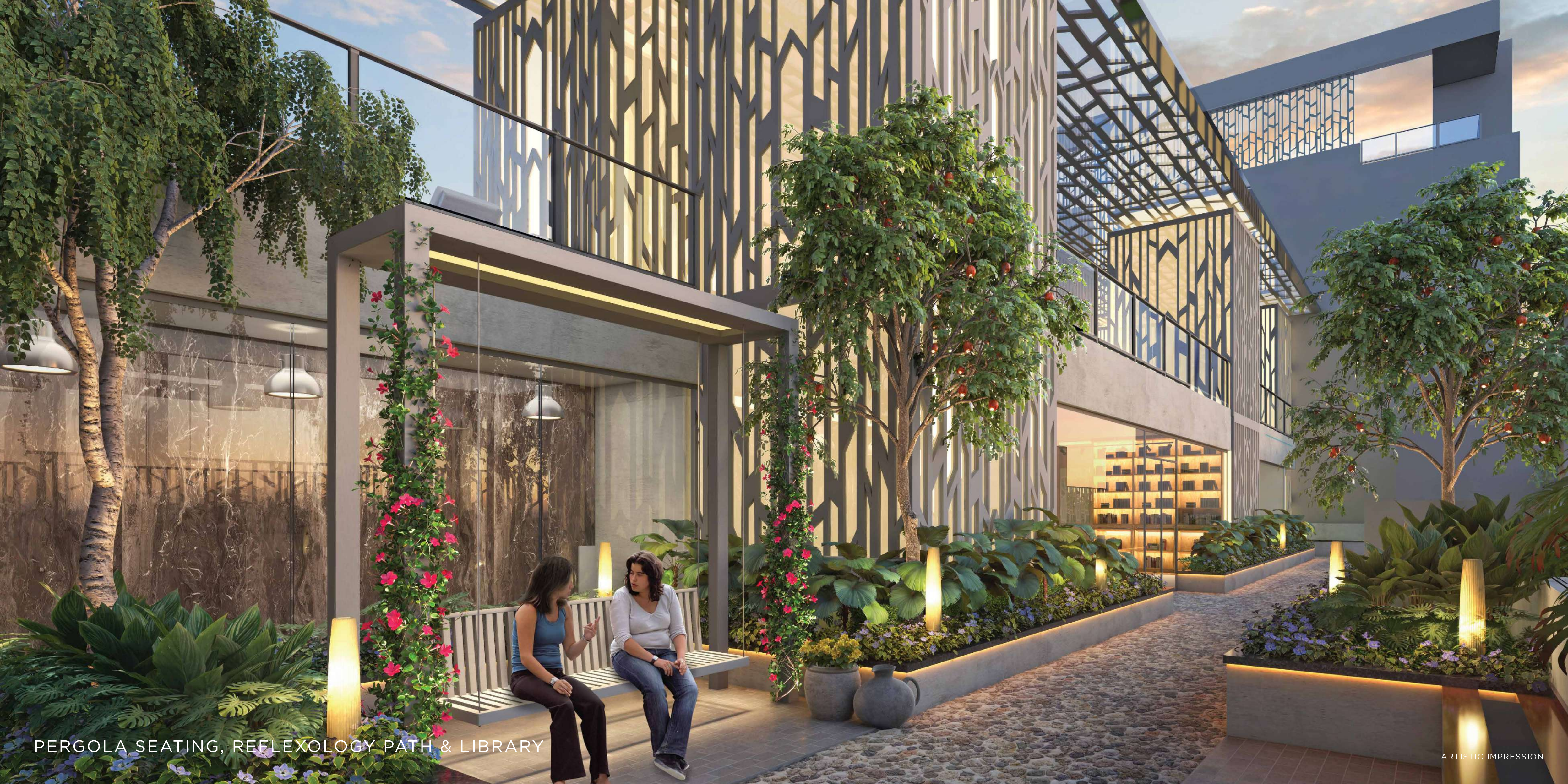
PERGOLA SEATING, REFLEXOLOGY PATH & LIBRARY