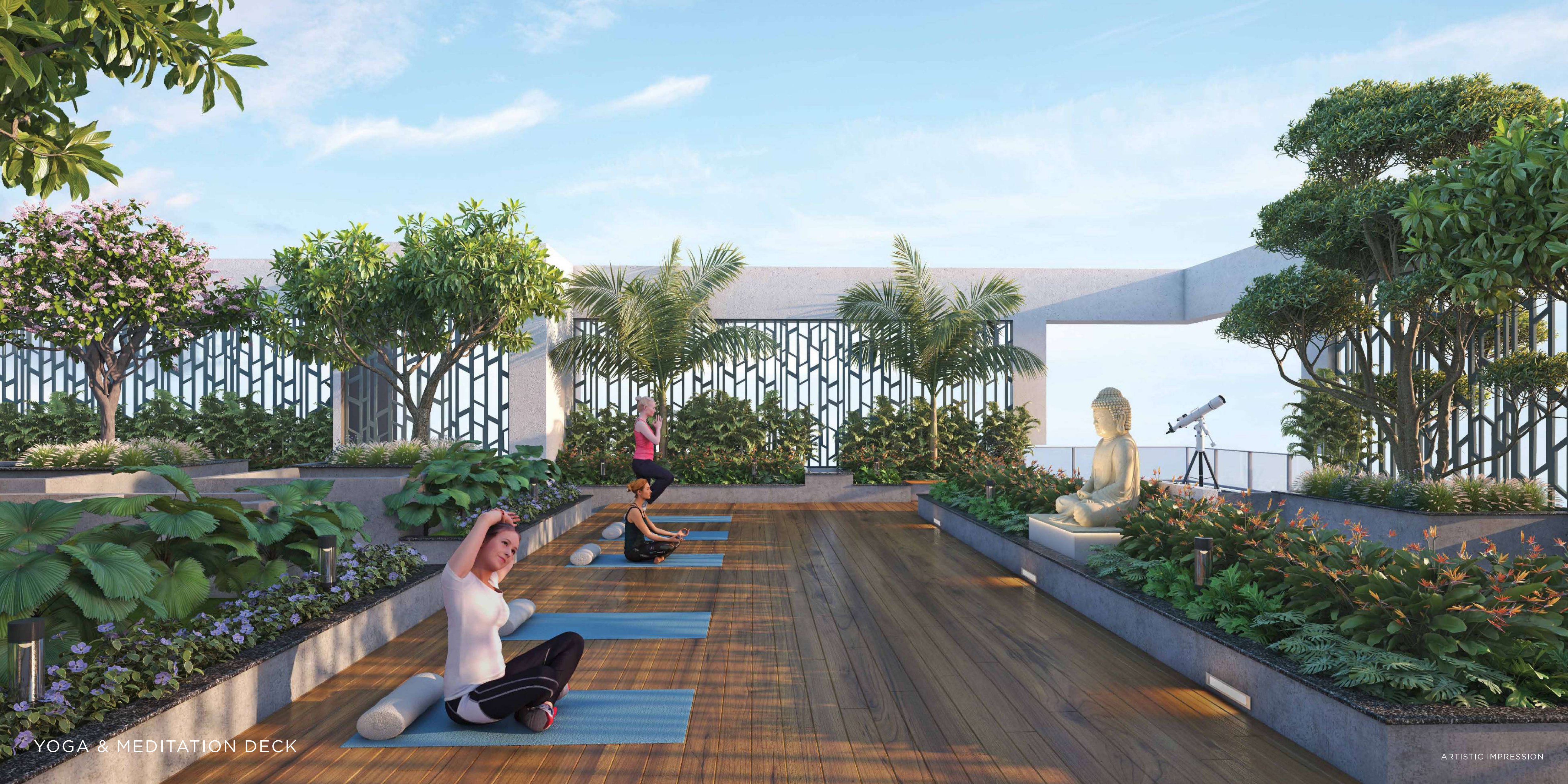
YOGA & MEDITATION DECK