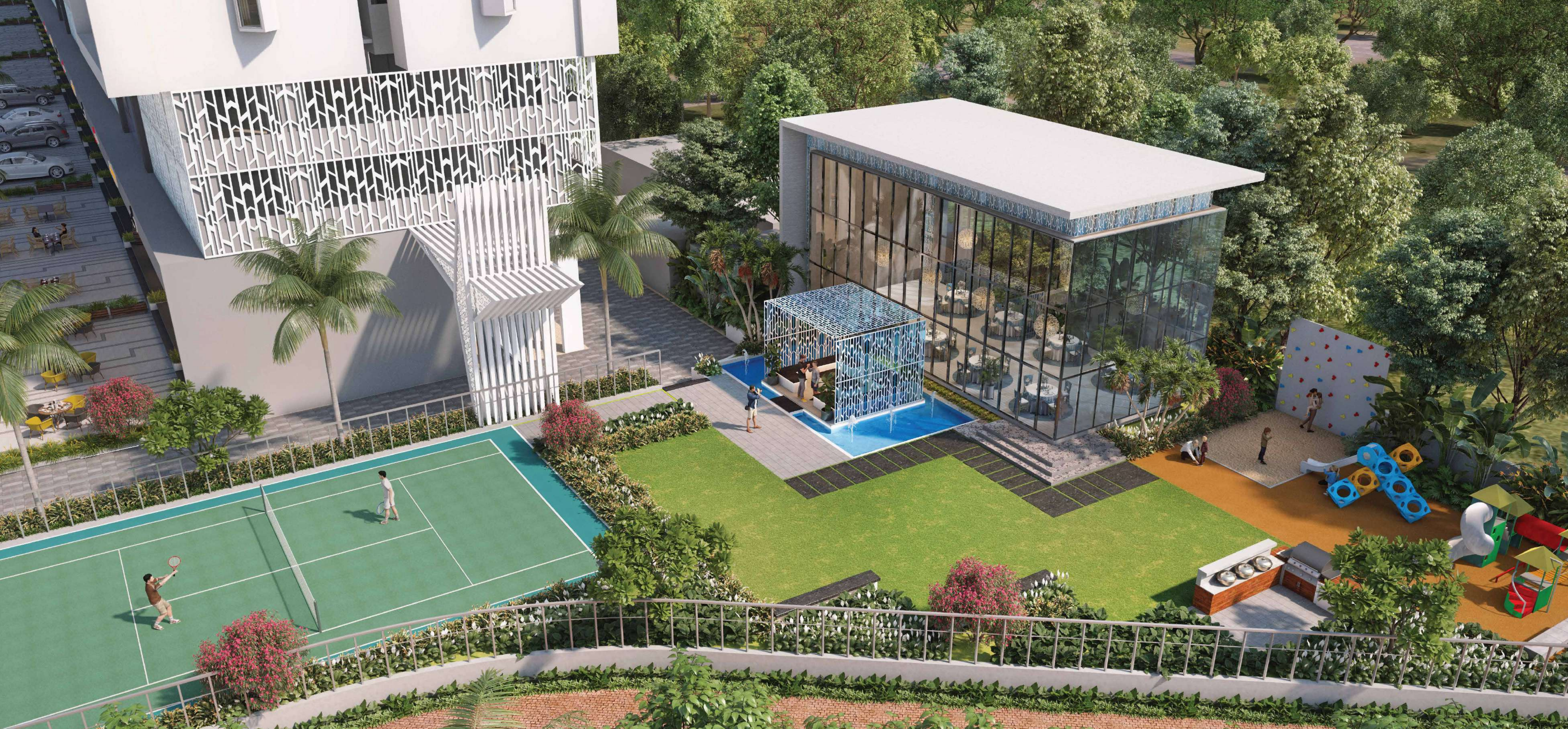
CLUBHOUSE, PARTY LAWN & MULTIPURPOSE COURT