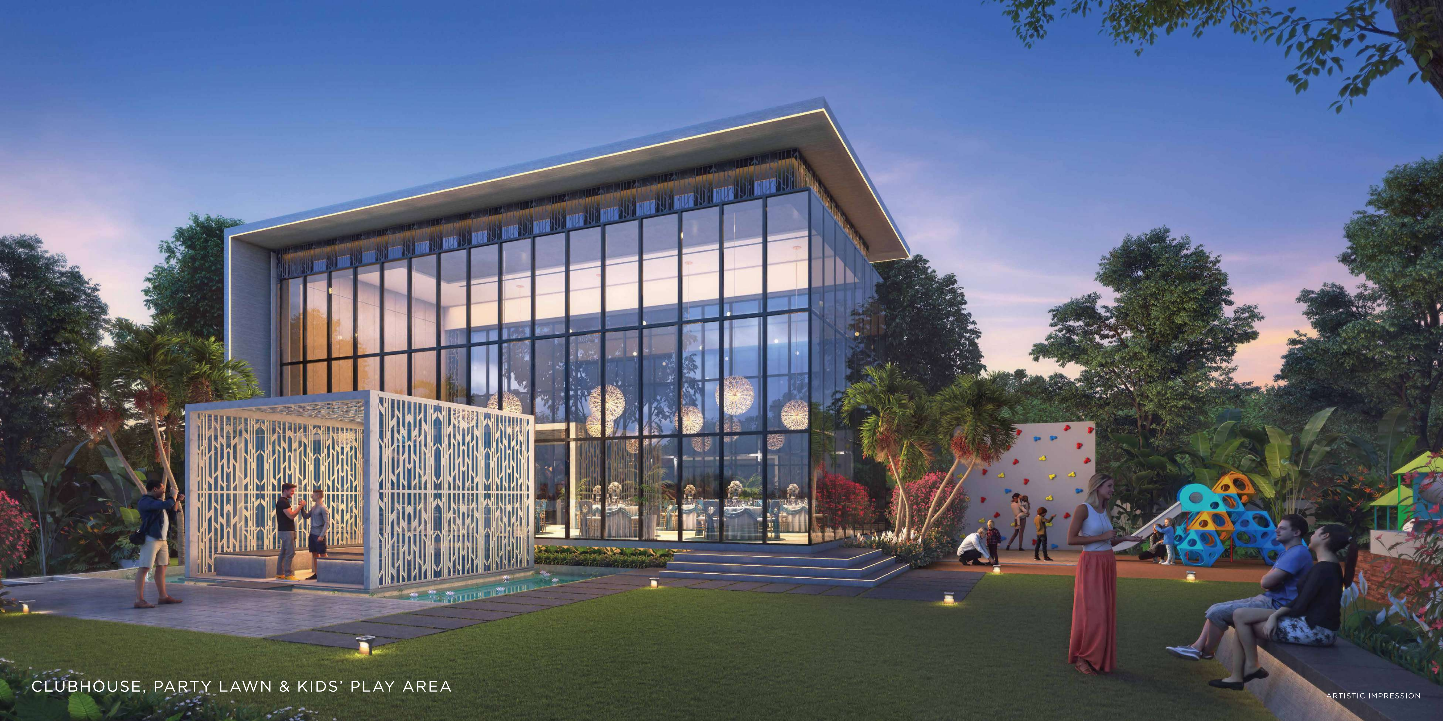
CLUBHOUSE, PARTY LAWN & KIDS' PLAY AREA