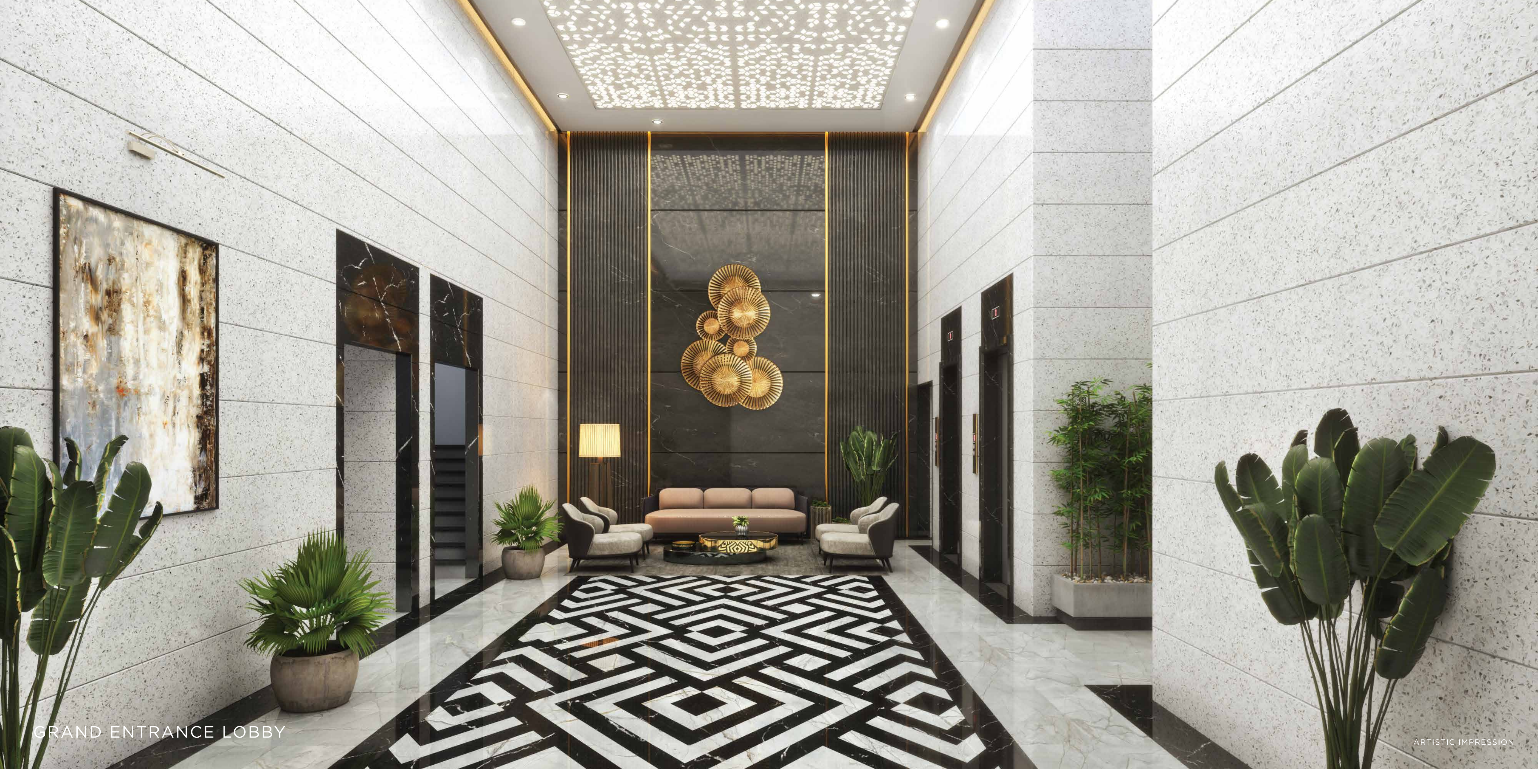
GRAND ENTRANCE LOBBY